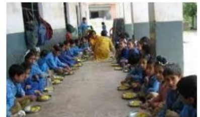
The Midday Meal Scheme has helped in reducing the caste inequalities as children belonging to different castes eat their meals together

While some people are treated unequally on the basis of the caste system, some are discriminated against on the basis of religion. In many cities, houses are not given on rent to people belonging to one particular religious community.