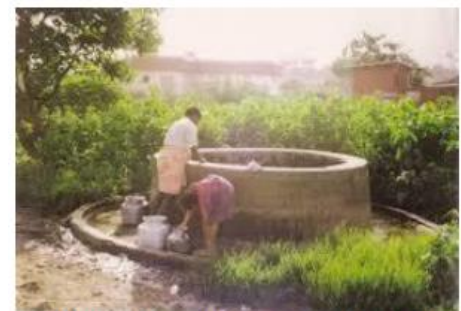
Every citizen of the country has the right to use wells, tanks and ghats maintained fully or partly out of the state funds